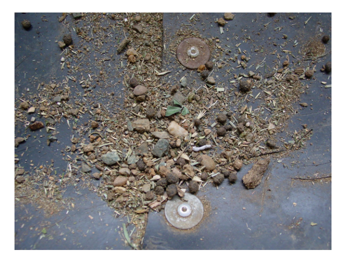
Fig 2: Faeces from cottontail rabbits found at the bottom of a hay feeder in a weanling pasture from a farm in northern California with endemic occurrence of EPE.

Faeco–oral transmission of L. intracellularis has been documented in naïve foals housed with clinically infected foals experimentally challenged with an equine isolate of L. intracellularis [30]. A recent study has shown that faeces from experimentally infected rabbits with an equine isolate of L. intracellularis [30]. A recent study has shown that faeces from experimentally infected rabbits with an equine isolate of L. intracellularis [31]. Although infected rabbits and foals remained asymptomatic, infection was supported by faecal shedding of L. intracellularis and detection of specific antibodies to L. intracellularis . Although the natural infectious dose for foals has not been determined, pigs receiving as low as 10^5 L . intracellularis have been shown to develop infection [32]. Recent