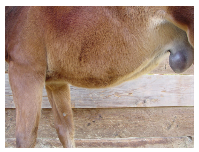
Fig 6: Six-month-old Quarter Horse colt with proliferative enteropathy displaying ventral and scrotal oedema.

There are characteristic case details, seasonality, clinical signs and blood work abnormalities associated with EPE. The disease is generally manifested in foals less than one year of age and in North America is often seen between August and February [16]. Although the disease is commonly seen in weanling foals 4–7 months of age, cases of EPE have been seen in young adults [20]. Lethargy, anorexia, fever (>38.5°C), peripheral oedema (ventrum, sheath, throatlatch and distal limbs; Fig 6), weight loss (Fig 7), colic and diarrhoea are among the most common clinical findings in affected foals. Early clinical signs are generally unspecific and include mild depression, partial anorexia and fever. Although diarrhoea is commonly seen in affected foals and can vary from cow pie to watery, some affected foals may have normal faecal character. Foals with EPE may also have concurrent disorders such as respiratory tract infections, gastric