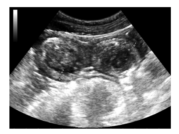
Fig 8: An ultrasound image showing a thickened section of small intestinal wall in a 7-month-old Thoroughbred colt with proliferative enteropathy. The wall thickness measured between 5.4 and 6.0 mm (normal wall thickness \leq 3 mm).

It is important to treat affected animals early before lesions become advanced and result in marked weight loss and critically low serum protein concentrations. Treatment of EPE in horses involves the use of antimicrobials such as macrolides, alone or in combination with rifampin, chloramphenicol, oxytetracycline or doxycycline administered for 2-3 weeks. The choice of antimicrobial in the treatment of EPE should take into account the risk of inducing disturbance of the gastrointestinal flora and renal toxicity. This is especially a concern when treating older foals with severe hypoalbuminaemia. National and international policies on antimicrobial use in horses should also be considered [55]. Supportive care such as i.v. fluids, plasma transfusion, parenteral nutrients and anti-ulcer drugs are commonly used to treat affected foals. Concurrent medical conditions should also be addressed. Rapid clinical improvement following treatment is to be expected; however, it may take weeks for the hypoproteinaemia to resolve. Spontaneous recovery of clinically infected foals has not been documented and up to 93% of treated foals usually survive the disease [16]. However, in more recent years the authors have seen more severe cases presented to veterinary hospitals with a poorer outcome. Generally nonsurvivors develop complications associated with