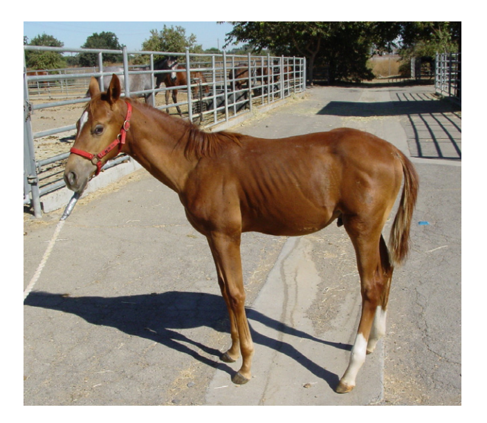
Fig 7: Severe weight loss in a 5-month-old Quarter Horse colt with proliferative enteropathy.

ulceration and intestinal parasitism. One must keep in mind that signs of EPE may resemble those of more common gastrointestinal disorders such as parasitism, bacterial infections ( Clostridium spp., Salmonella spp., Rhodococcus equi , Neorickettsia risticii ), rotavirus, coronavirus, ulcerations, sand accumulation, intestinal obstruction and intoxication with plants, chemicals and pharmacologic agents such as nonsteroidal anti-inflammatory drugs or antimicrobials. Similar to pigs, the disease can be subclinical in foals and be manifested by a self-limiting and transient decrease of total serum protein concentration coupled with decreased daily weight gain when compared with unaffected foals [30,33]. It will remain to be determined if growth retardation or unthriftiness are associated with subclinical infection.