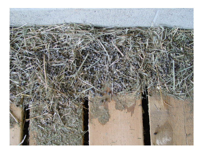
Fig 1: Heavy contamination of hay with faeces from cottontail rabbits at a farm in northern California with endemic occurrence of equine proliferative enteropathy.

recently identified farm in northern California endemic for EPE, 7.5% of faecal samples and 27% of serum samples from cottontail rabbits tested PCR positive and seropositive for L. intracellularis , respectively [29]. Of interest was that on this farm, a large population of cottontail rabbits lived in the hay barn and had direct access to the hay fed to the horses. An epidemiological investigation on this farm showed rabbit faeces on top of hay bales but also in the feeders of the weanling foals, suggesting that the foals developing EPE were likely exposed to L. intracellularis via the oral ingestion of infected rabbit faeces (Figs 1, 2). Similar to rodents, lagomorphs may represent an effective reservoir/amplifier host due to their large population, their close contact to horses and short reproductive cycle. It still remains to be determined how L. intracellularis became endemic in the rabbit population on this farm.